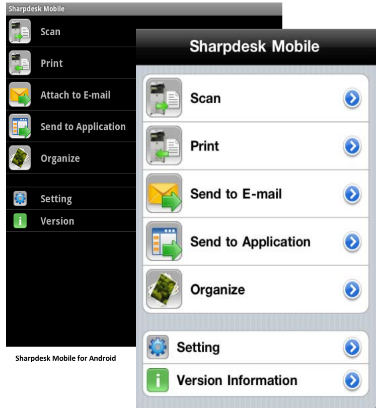
Sharpdesk Mobile for Android

*Bonjour must be enabled to auto-discover supported MFPs.